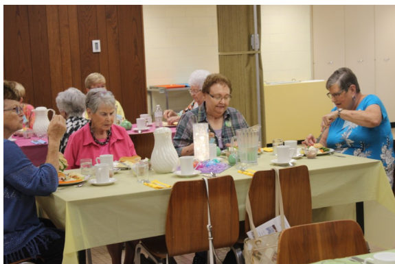
Delicious luncheon served by staff at Maryvale.